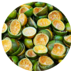
Food residues and by-products