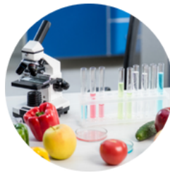
Innovative analytical techniques