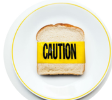
Food safety and contaminants