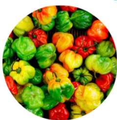
Food bioactives and botanicals