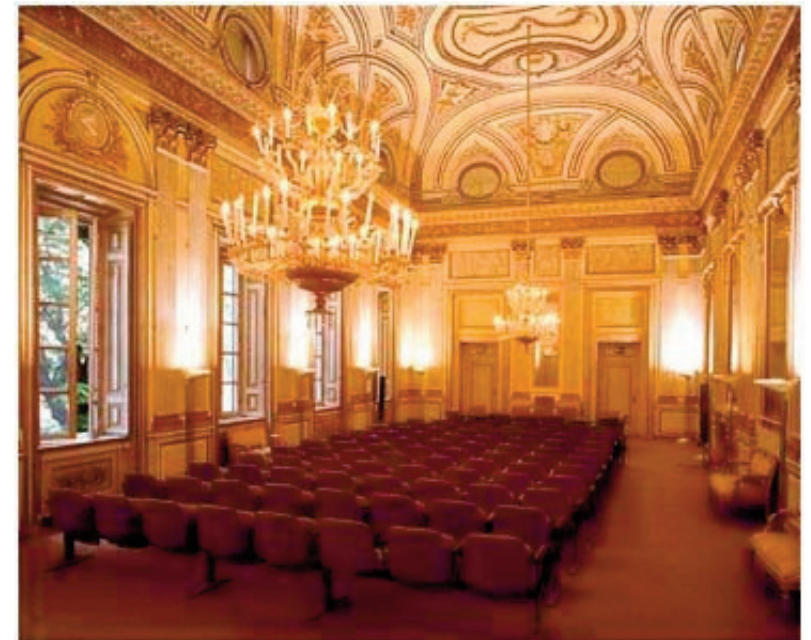
Sala Napoleonica, Palazzo Greppi University of Milan, "La Statale"